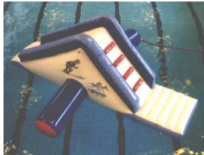
Alpine Slide Inflatable

We have three inflatables (bear cub, hound dog or alpine slide) that can be added to your party for $50.00.